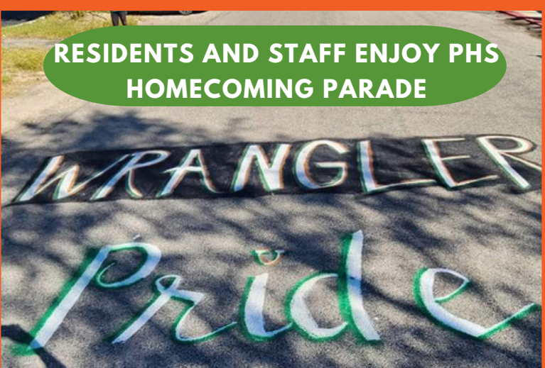
RESIDENTS AND STAFF ENJOY PHS HOMECOMING PARADE