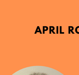
APRIL ROGERS- 12 YEARS